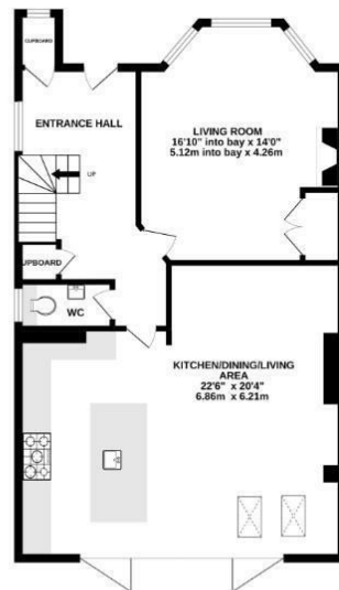
GROUND FLOOR 775 sq.ft. (72.0 sq.m.) approx.