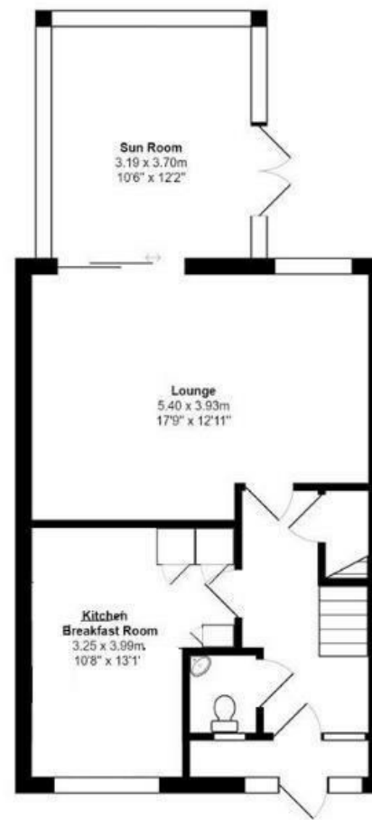
Ground Floor Area: 56.2 m 2 ... 605 ft 2

The property fronts the communal green in the heart of Parsonage Road which is within an easy walk of the High Street, primary school and sports centre. Henfield village offers local amenities including shopping facilities, village hall, library, health centre, churches, primary school and sports centre. A bus service passes through the village to the town centres of Horsham and Brighton offering more comprehensive shopping and leisure facilities. The nearest mainline stations are at Hassocks, Burgess Hill, Horsham, Haywards Heath and Shoreham-by-Sea. Crawley, Gatwick Airport and London are accessible via the A23/M23.