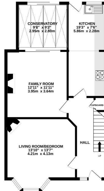
GROUND FLOOR 637 sq.ft. (59.2 sq.m.) approx.