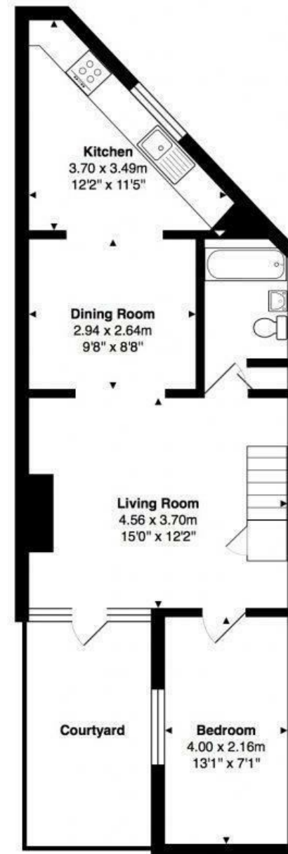
Lower Ground Floor Area: 47.9 m 2 ... 515 ft 2

Hanover is an extremely popular area of the city. It has signature bright and colourful terraces of Victorian houses, is close to the city centre and within walking distance of Brighton Station. Often considered to be one of Brighton's bohemian strongholds, it has an active artistic community and a young, lively atmosphere, with more than its fair share of excellent pubs, where you can find good company, great food and live music, including the Village pub further down Islingword Road. Queen's Park is a beautiful park with a café; if you enjoy walking you can easily walk to the park, the sea or to the city centre.