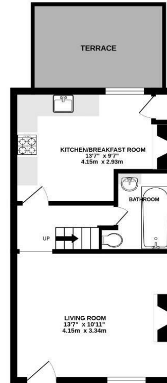
GROUND FLOOR 327 sq.ft. (30.4 sq.m.) approx.