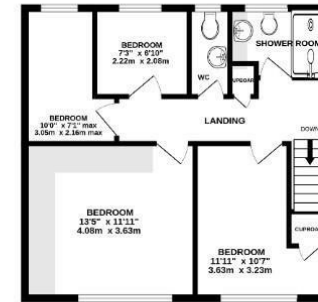
FIRST FLOOR 530 sq.ft. (49.2 sq.m.) approx.