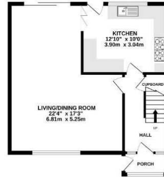
GROUND FLOOR 654 sq.ft. (60.8 sq.m.) approx.